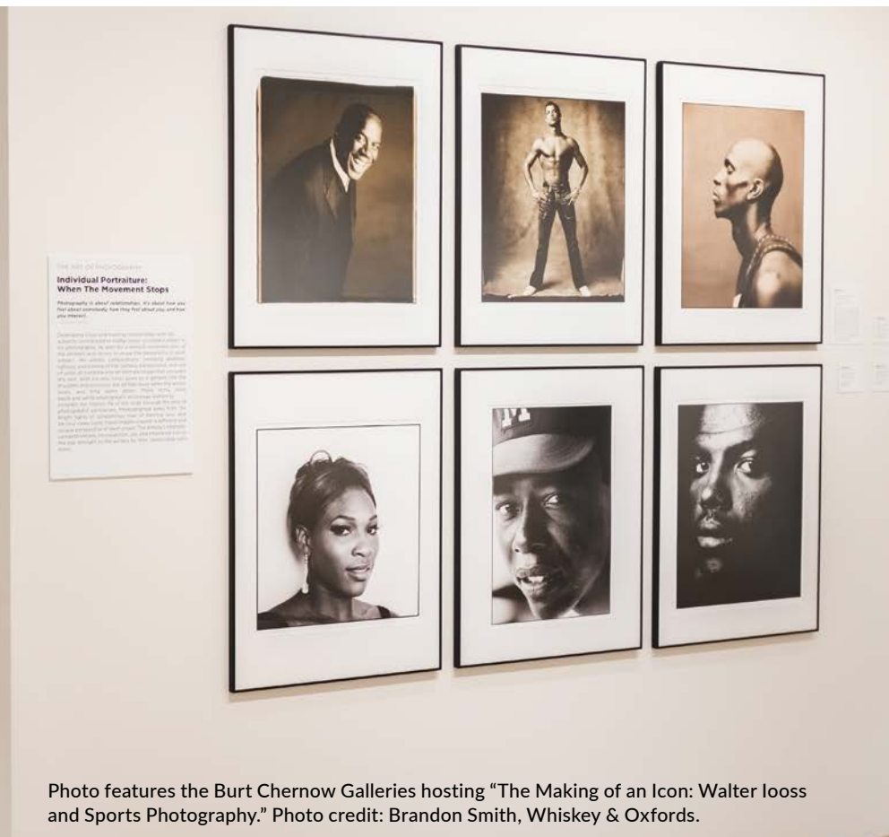
Photo features the Burt Chernow Galleries hosting "The Making of an Icon: Walter looss and Sports Photography."

The Housatonic Museum of Art is a leader among community college art museums in the United States. Not only does the museum steward one of the largest art collections of any two-year institution (7,000 artworks), but it is also forging a new path towards collaboration across the nation with groundbreaking events and partnerships.